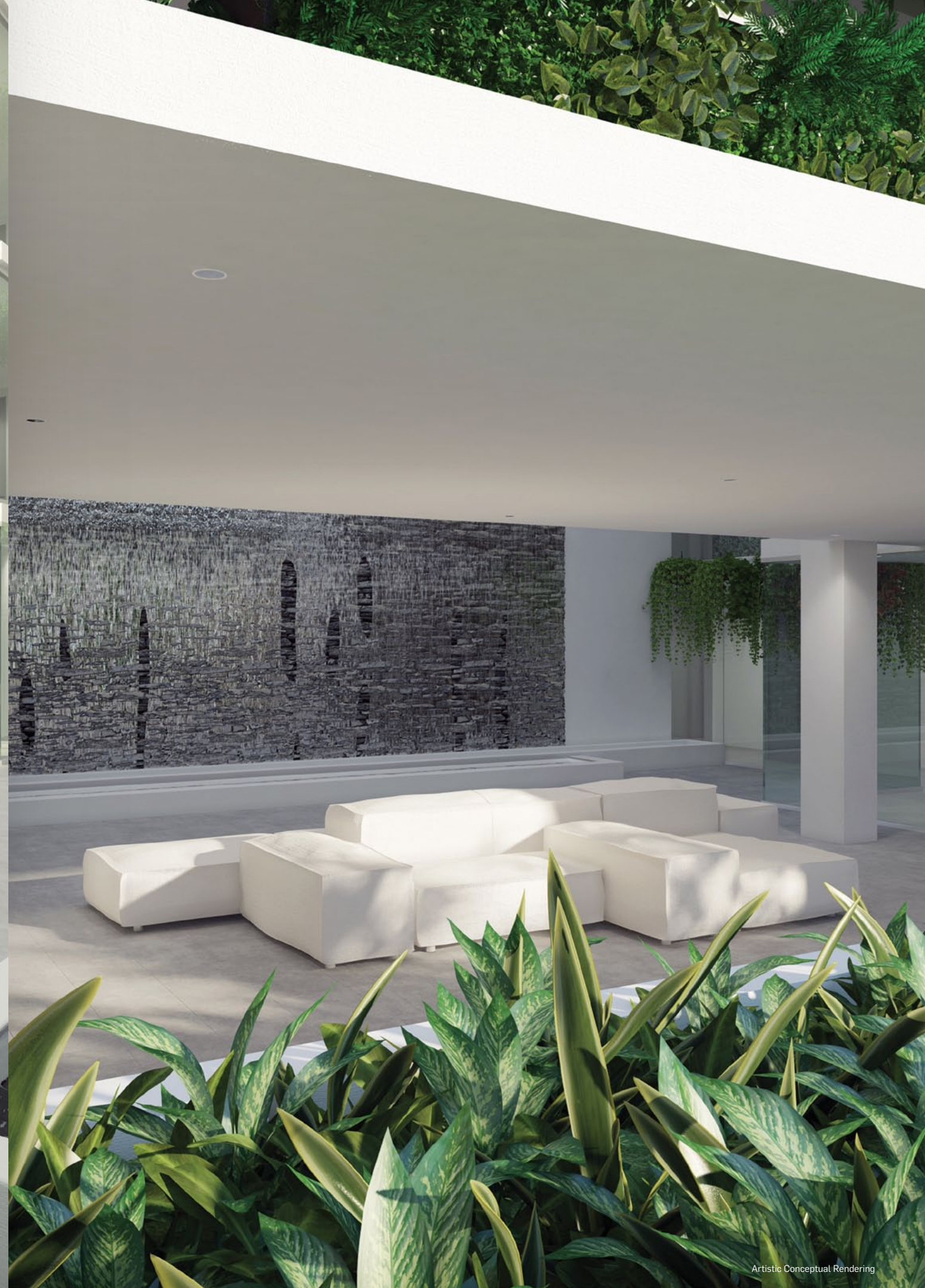
Artistic Conceptual Rendering