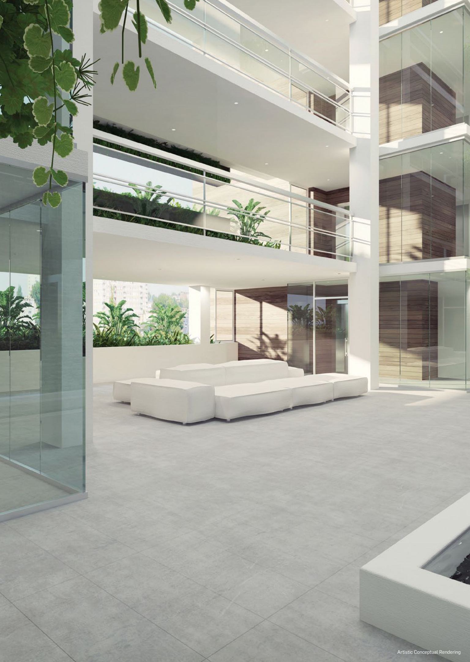
Artistic Conceptual Rendering